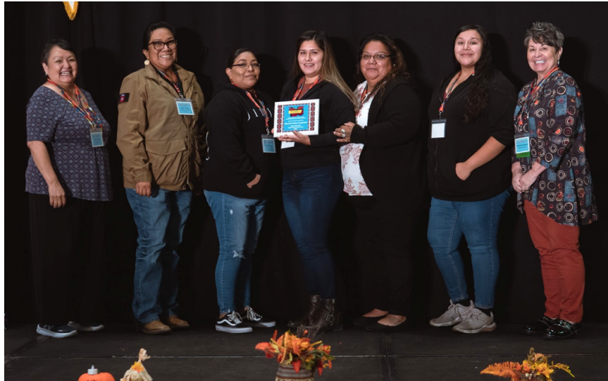
Figure 4. Gila River Health Care CHR staff with Michelle Archuleta, National IHS CHR Consultant

The CHR Tribal Program of the Year also had multiple honorees: The Tohono O’odham Nation and Gila River Health Care were both recognized as outstanding programs based upon their numerous peer nominations. Figure 4.