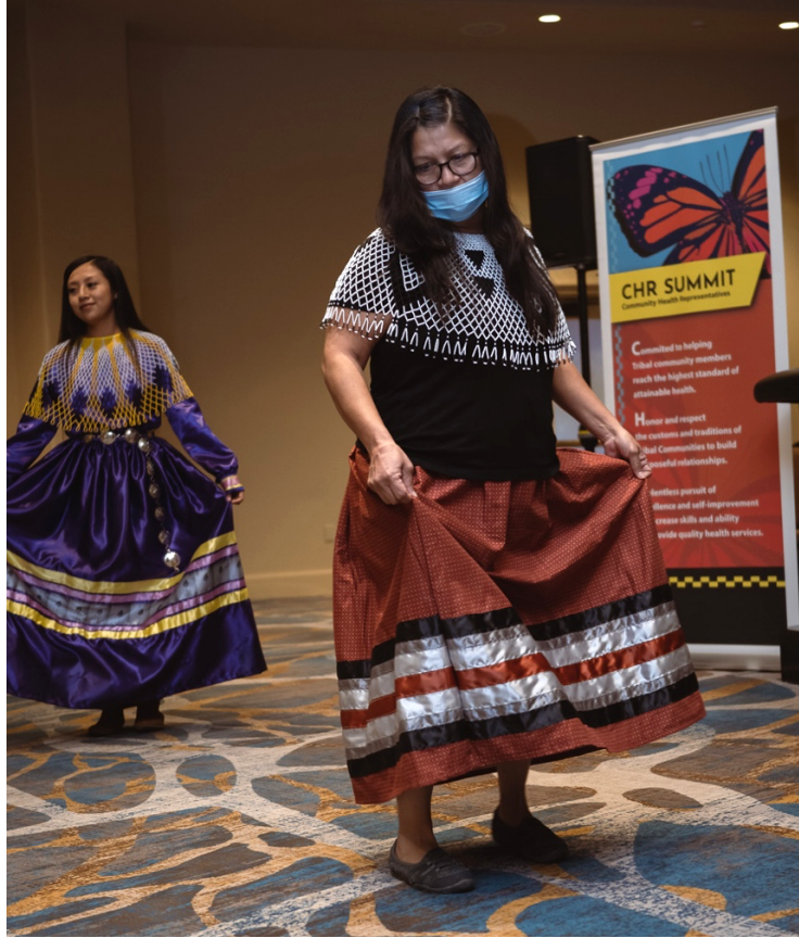
Figure 8. Hualapai Tribe CHR/CHWs performing a traditional dance at the Cultural Sharing Reception

The Cultural Sharing Reception in the evening provided continued opportunities for networking and learning about each other. The Hualapai CHR/CHW Team started off the night with a traditional ceremonial dance that celebrated their Tribal Heritage. Figure 8. The Hopi CHR Team was next with a social (ceremonial) dance. The Hualapai Team then asked everyone in the audience to participate in the Round Dance. The evening ended with multiple donated prizes being raffled to those in attendance.