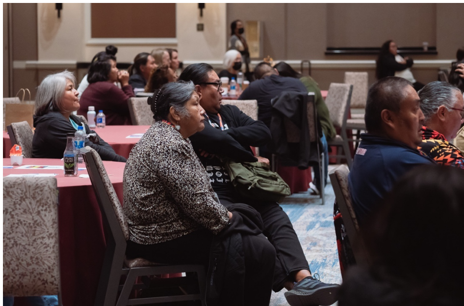
Figure 10. CHR Summit VI Attendees at a Plenary Session Presentation